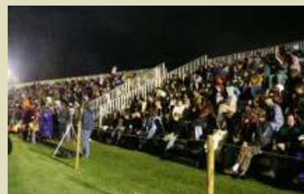
Abbey Museum of Art and Archaeology Inc. 2007